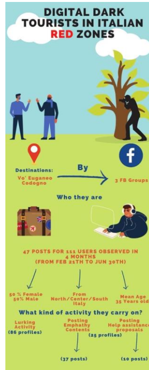
FIGURE 1. Digital Dark tourists in Italian red zones.

After a manual process of categorization of all the retrieved post, we can affirm that the posting activities 3 from potential digital dark tourists are generally short messages expressing empathy while few of them offered help and assistance to the residents. Next figure sums up the degree of involvement of the non-local users considered as potential dark tourists acted during our observation: